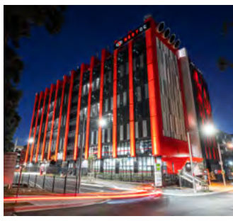
S2 Sydney 6-8 Giffnock Avenue, Macquarie Park NSW 2113