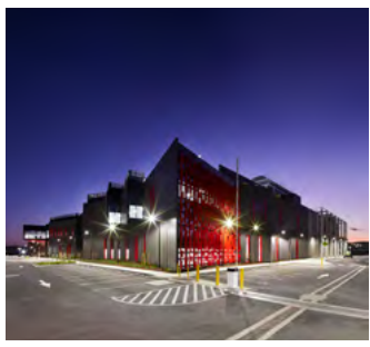
M3 Melbourne 25 Indwe Street, West Footscray VIC 3012