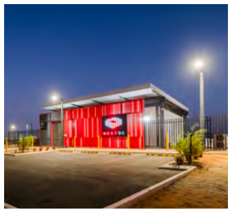
PH1 Port Hedland 17 Loreto Circuit, Port Hedland WA 6721