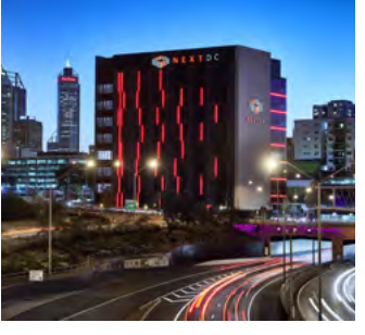
P2 Perth 11 Newcastle Street, Perth WA 6000