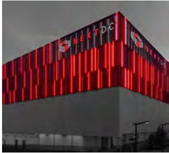
S6 Sydney 3 Broadcast Way, Artamon NSW 2064