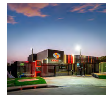
D1 Darwin 2 Harvey Street, Darwin NT 0800