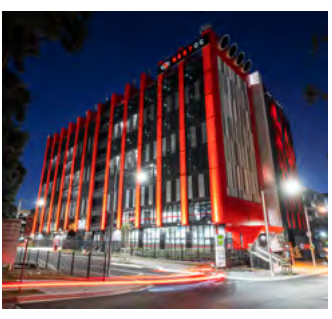
S2 Sydney 6-8 Giffnock Avenue, Macquarie Park NSW 2113