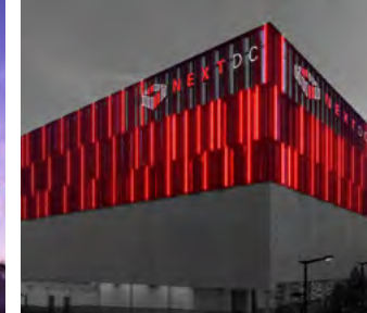
S6 Sydney 3 Broadcast Way, Artamon NSW 2064