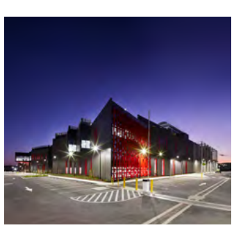
M3 Melbourne 25 Indwe Street, West Footscray VIC 3012