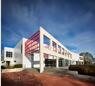
C1 Canberra 19 Battye Street, Bruce ACT 2617