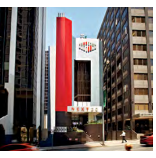
B1 Brisbane 20 Wharf Street, Brisbane City QLD 4000