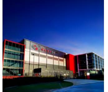
P1 Perth 4 Millrose Drive, Malaga WA 6090